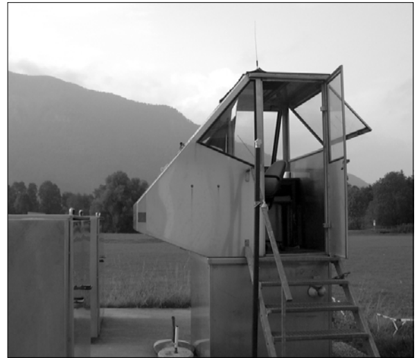
The winch cab puts the driver another six feet higher.

glider as she already did it! It took a while to sort things out. The lady was a student there, she DI'd the glider and put it aside, waiting for the wind to pick up so that she could go soaring. She didn't know what I wanted and was very defensive about "her baby". I explain that all I want is a circuit, but it took some effort to convince her that I will bring it back in good time for her. We did the positive control checks together.