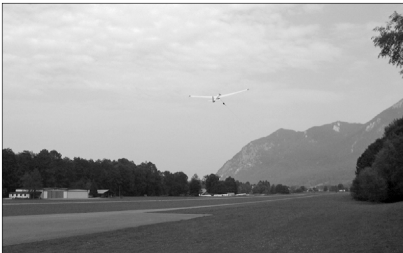
Winch launch underway at the DASSU airfield.

But I had much better luck this spring. Inquiring again, I was informed that the Fox was now owned by one person. It just went through a major re-fit by the factory and the owner made it available for all members of the Hungarian Aerobatic Team for practice. They also have a Swift available. I heard that it is owned by the central Hungarian flying/gliding club and is assigned to the team, but with the current Hungarian economic status in turmoil, one cannot be sure who will own it. It happened that I was just talking to one of the team members and he actually guided me to the airport where they practised, right then.