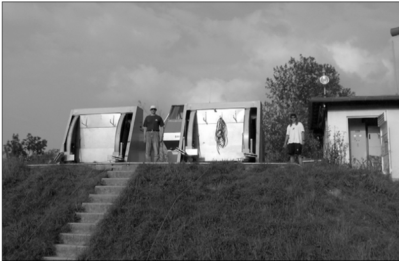
Unterwössen's massive dual 2-drum electric winches set atop their own hill.